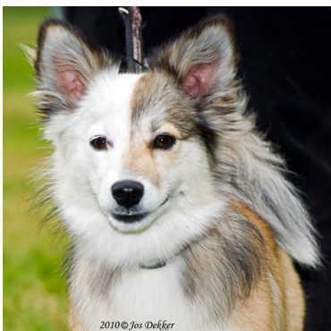
Photo 8. irregular white markings on a red Icelandic Sheepdog

The dominant allele is S, S for solid, this allele allows the two pigments to express themselves all across the skin. Dogs that have two S alleles, will show a solid color with peripheral white markings only. Dogs that have two s^p alleles, will show piebald spotting, see photo 8 and 9.