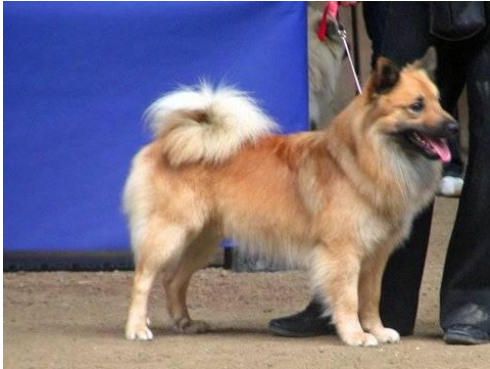
Photo 1. Red Icelandic Sheepdog with black mask

We can distinguish several loci in dogs with genes that influence the coat colors. Most dog breeds have a selection of colors and also a selection of possible genes on these loci. Here we will discuss only the genes that influence the colors in Icelandic Sheepdogs. We will discuss 5 loci with more than one possible allele that are responsible for the color patterns in our breed. This will be A, the agouti locus; B, the black/brown locus; E, the extension locus; I, the intensity locus; and S, the spotting locus.