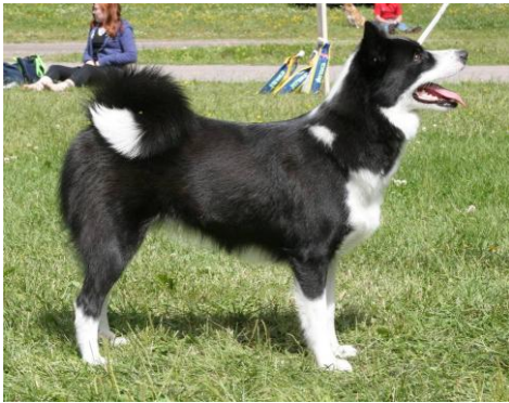
Photo 4. Recessive black and white Icelandic Sheepdog

The recessive gene a^t on the agouti locus is responsible for the black and tan pattern. When the two a^t a^t alleles are present, the black pigment is allowed to spread over the largest part of the body. The red pigment is restricted to small areas, the so called tan markings: in the face, on the legs and below the tail. Photo 3 shows an Icelandic Sheepdog with this color pattern. The intensity genes can influence the red color in this color pattern also. Therefore we can find black and red dogs, as well as black and yellow dogs.