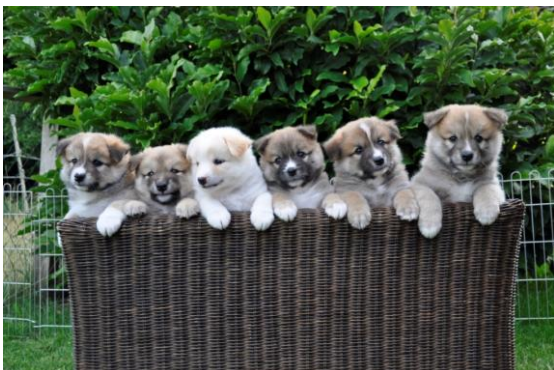
Photo 5. Litter with five red puppies and one cream