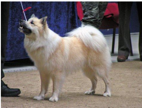
Photo 2. Yellow Icelandic Sheepdog with black mask