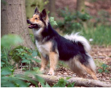
Photo 3. Black and red

The recessive gene a^t on the agouti locus is responsible for the black and tan pattern. When the two a^t a^t alleles are present, the black pigment is allowed to spread over the largest part of the body. The red pigment is restricted to small areas, the so called tan markings: in the face, on the legs and below the tail. Photo 3 shows an Icelandic Sheepdog with this color pattern. The intensity genes can influence the red color in this color pattern also. Therefore we can find black and red dogs, as well as black and yellow dogs.