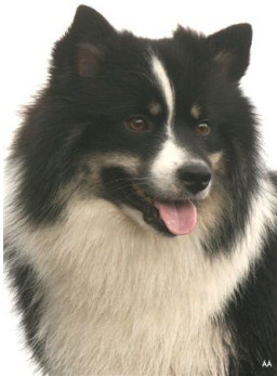
Photo 7. Peripheral white on a black and red Icelandic sheepdog

puppy is mature. The dog in photo 7 shows the typical white markings on the head that are peripheral white. Small blaze, part of the muzzle, white chest and collar. These markings are more or less symmetrical. The dog in photo 4. shows the white socks and the white tip of tail.