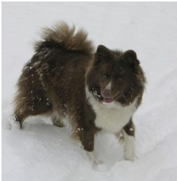
Photo 6. Brown with red and white Icelandic Sheepdog

Chocolate brown dogs receive their color from the black pigment eumelanine. The eumelanine can express as black or as brown. The gene that is responsible for eumelanine to produce the brown color, is b on the B locus. Besides the black pigment that becomes dark brown, also the pigmentation of the nose and eyes is affected. Brown dogs have a brown nose and often lighter colored eyes. The dominant B gene is responsible for the black pigment to become black, and also the nose to become black. The recessive b gene will produce a brown color where the dog would have been black with B. The B and b alleles will not affect the red pigment.