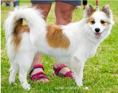
Photo 9. Piebald spotted Icelandic Sheepdog

In general the amount of white on a piebald dog can vary. The white markings either cover the ventral surface of the body or most of the body. Both piebald spotting patterns are available in our breed. See photo 9 for the white background with a piebald pattern of red patches.